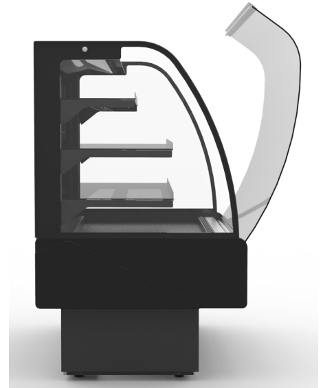
TILT OUT FRONT GLASS