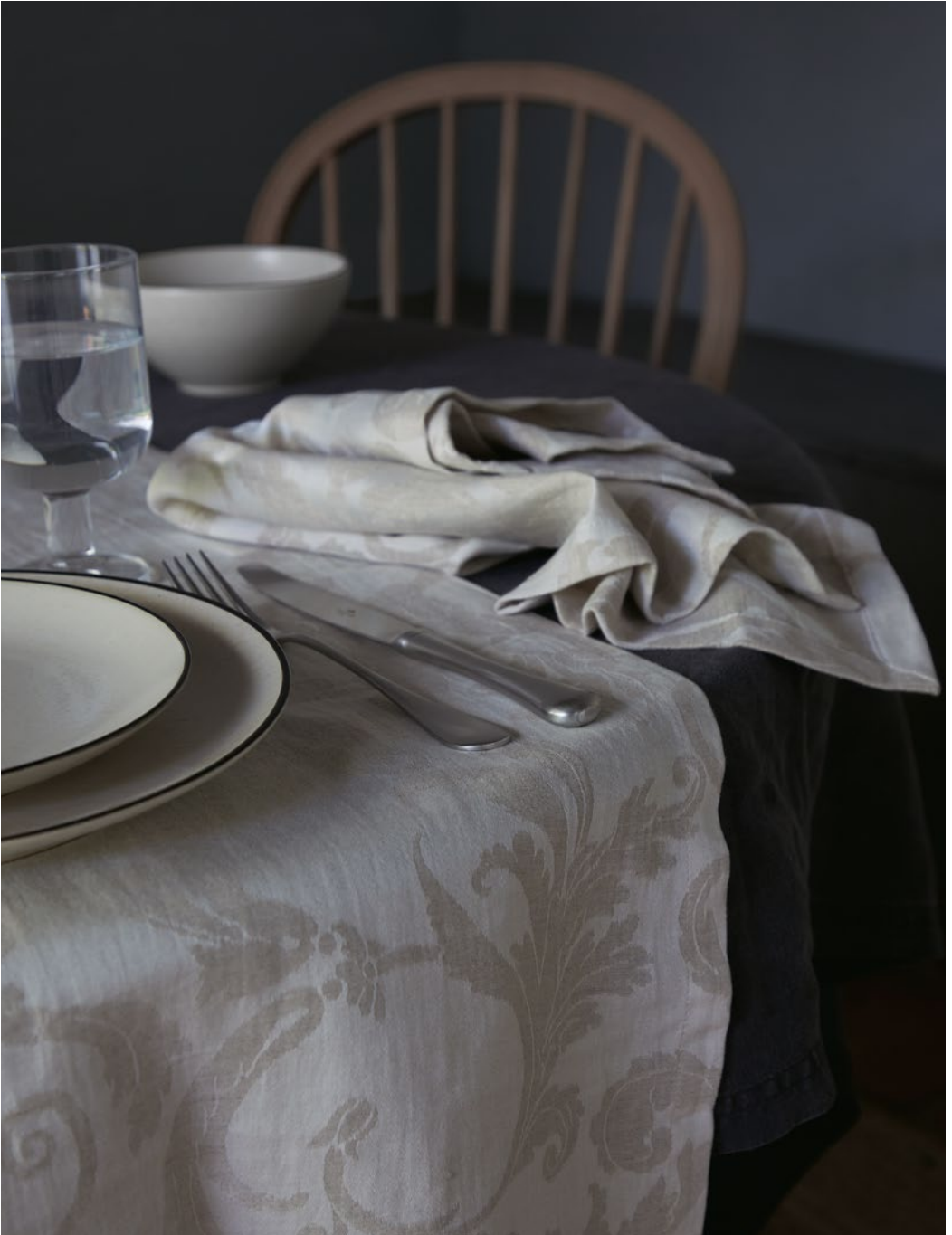
Above: Dalia runner and napkin in Cru with Augusta tableware, Antigo flatware and Safra glass.