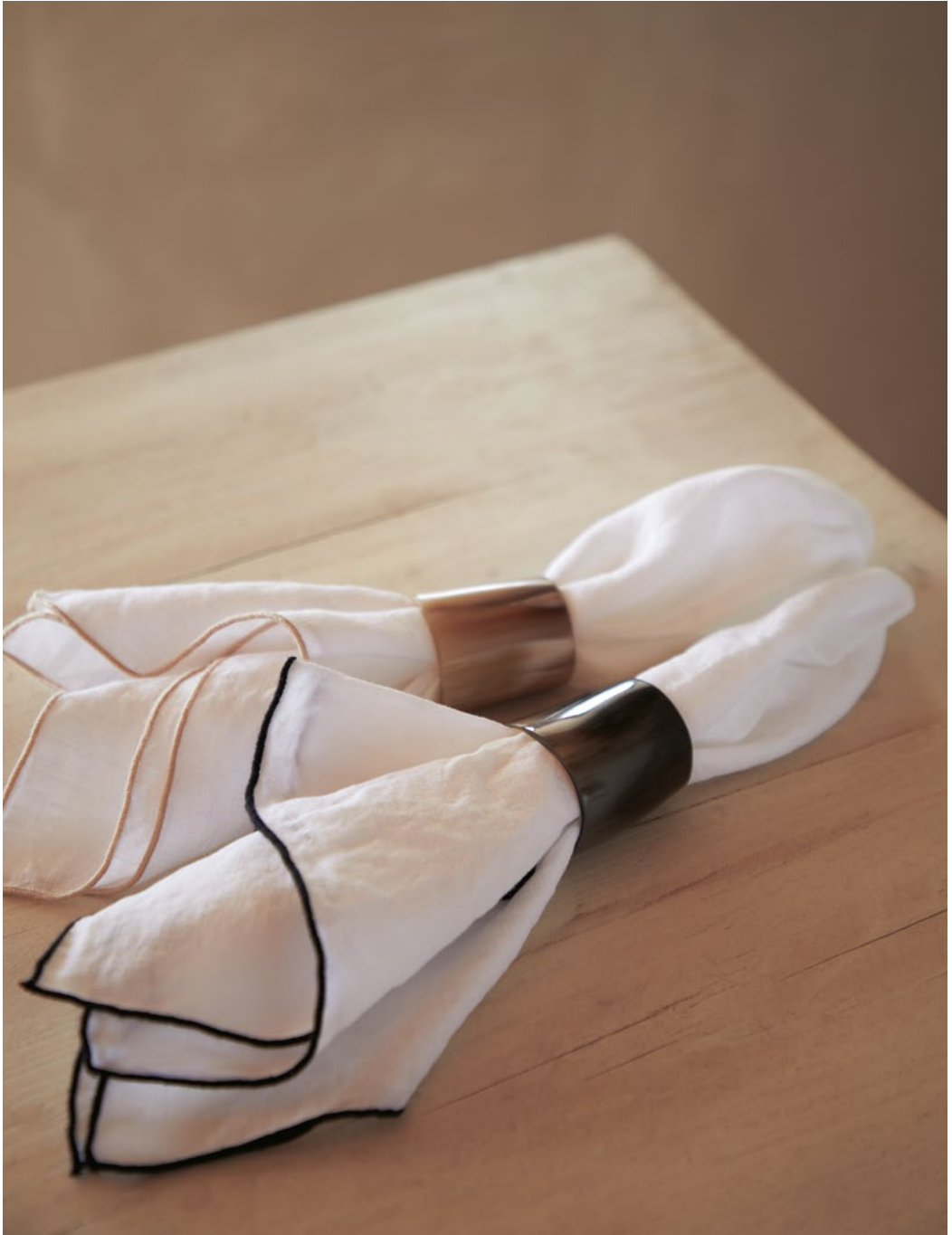
Bella napkins in tofu and black paired with horn napkin rings.