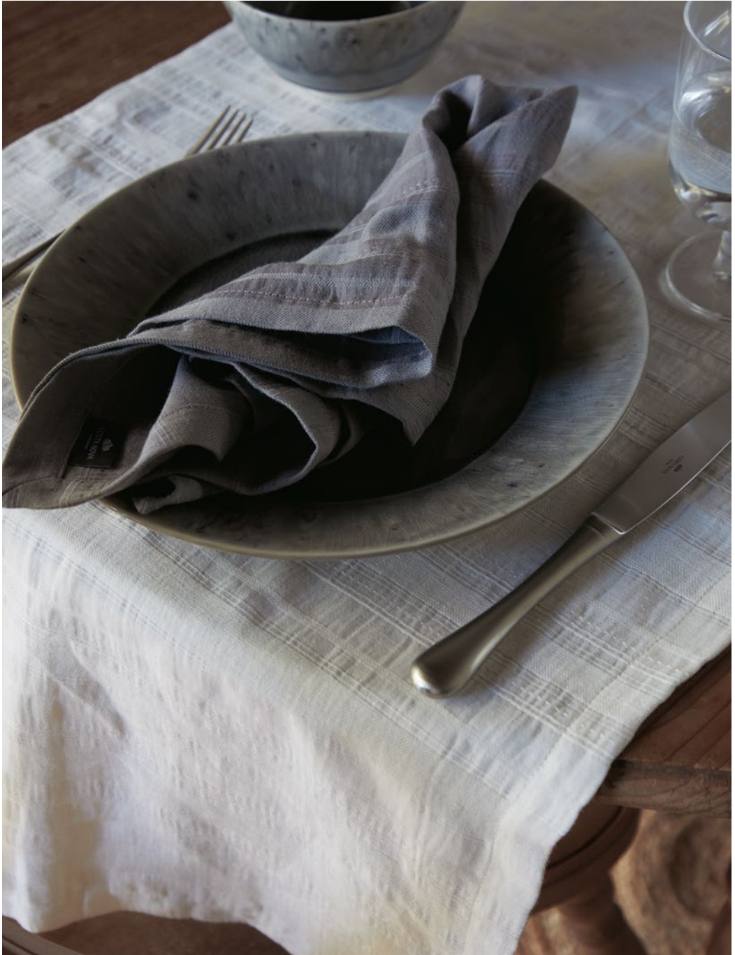
Above: Cascata runner in Fog and napkin in Dusk with Madeira dinner plate and Antigo flatware.