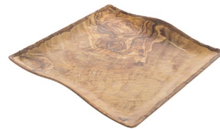
square platter number RFS500

dimensions (us + metric) L 24.5 62.23 W 16 40.64 H 2 5