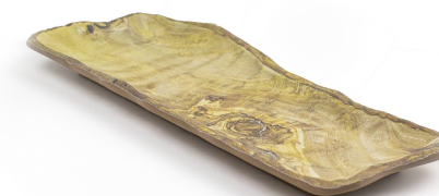
oblong plate - small

dimensions (us + metric) L 9.1 23 W 4.3 11 H 1 2.6