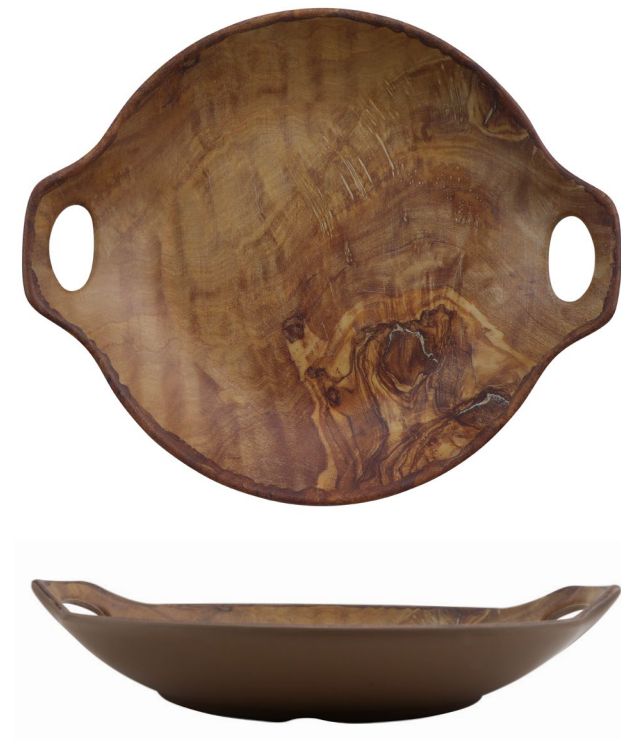
20580-TFM Plate with handles (wok) 7.75", 9" (w/ handles) 1dz