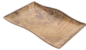
rectangle platter - medium number RFS502

dimensions (us + metric) L 14.5 26 W 10.2 18 H 1.38 3.5