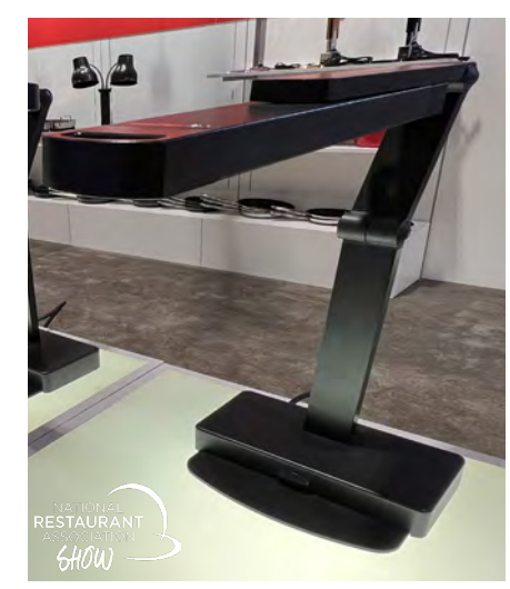
iLume shown daisy-chained in front-to-back warming, side-to-side warming, and folded format.