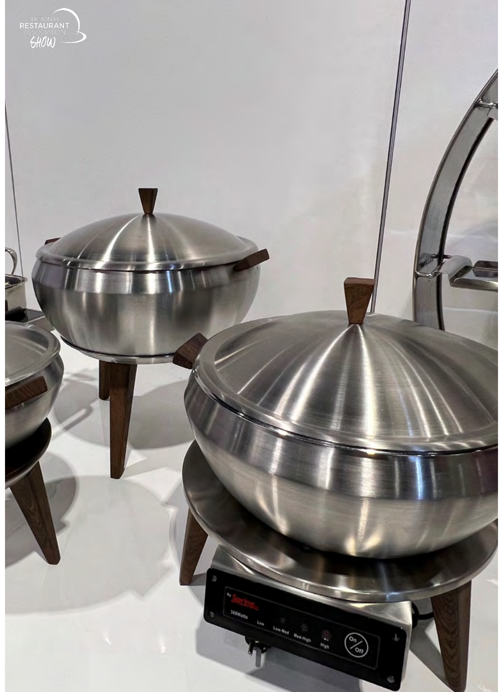
Induction DOT shown with Wynwood stand and servers.