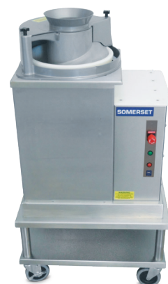
Dough Rounders & Moulders